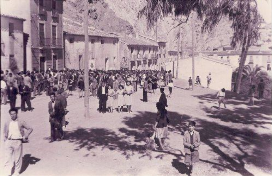
Pilgrimage of Saint Roque in the place “El Hundido”