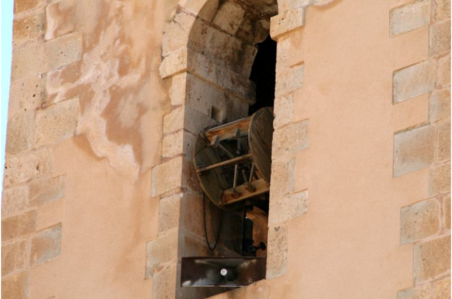
The Ratchet

The photo here beneath is captioned as a ratchet used in Holy Week in Spain. It is placed in the bell tower of Blanca and could be heard over a great distance. The use of noise makers in some religions is widespread at certain times when the sound of bells is banned.