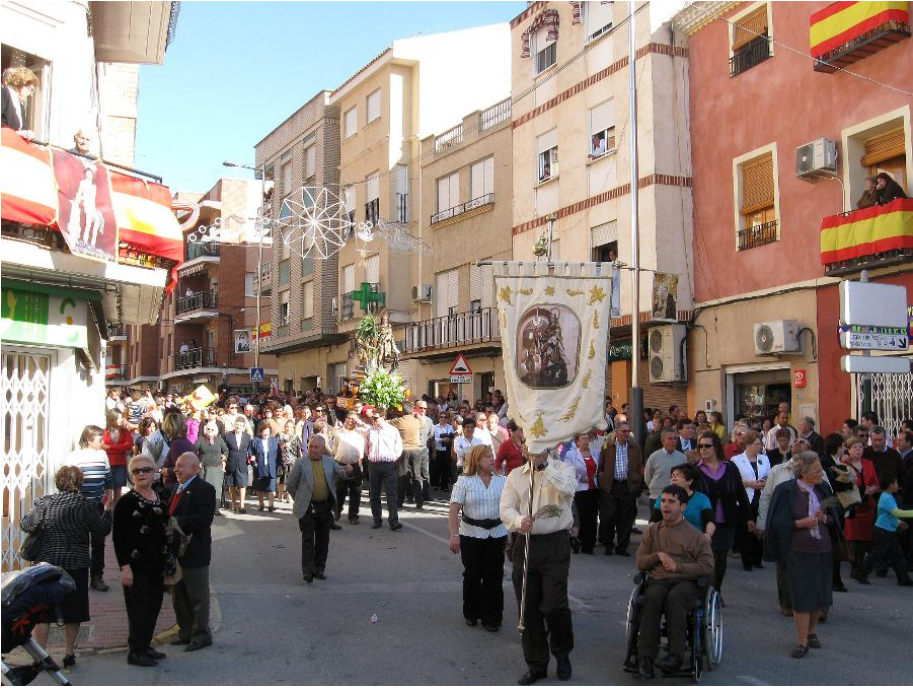
Procession of Saint Roque