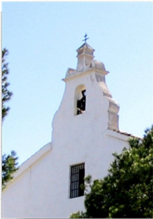
Hermitage “San Roque”