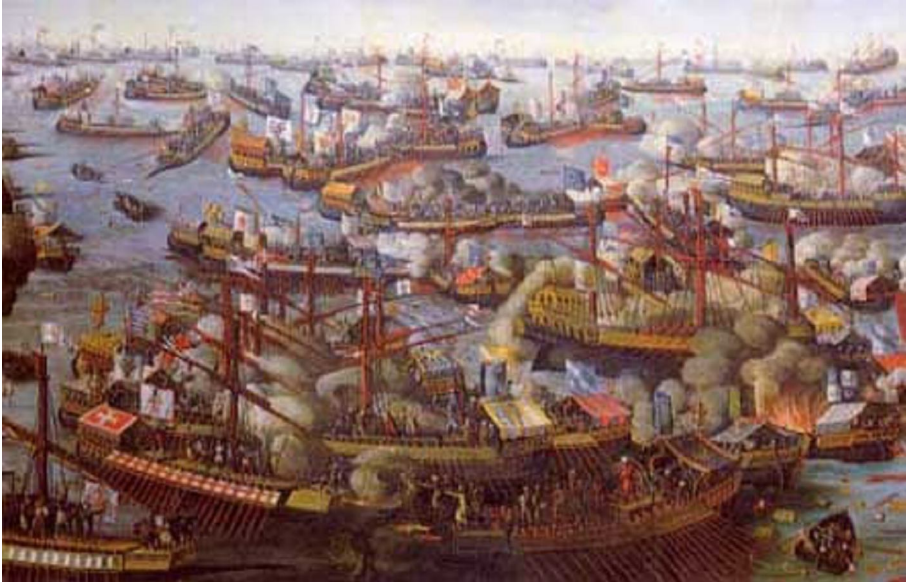
The battle of Lepanto Painting of Letter

enemy far superior in size. It was an all-or-nothing battle and before the attack the Christian troops prayed the rosary with devotion. The Battle of Lepanto lasted late into the evening, but the Christians were victorious. The Turks were defeated, most of their ships were sunk, and a storm completed the Turks' destruction. The power of the Turks on the sea had dissolved forever.