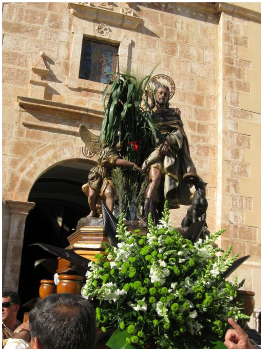
Saint Roque leaving the church