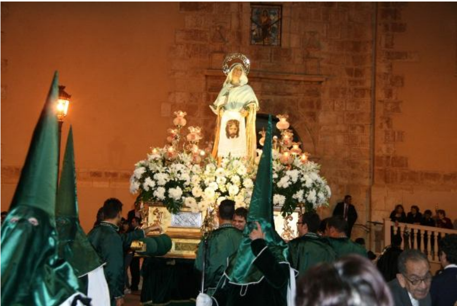
La Veronica Sculptor: Talleres de Arte cristiano de Olot (Gerona), 1944