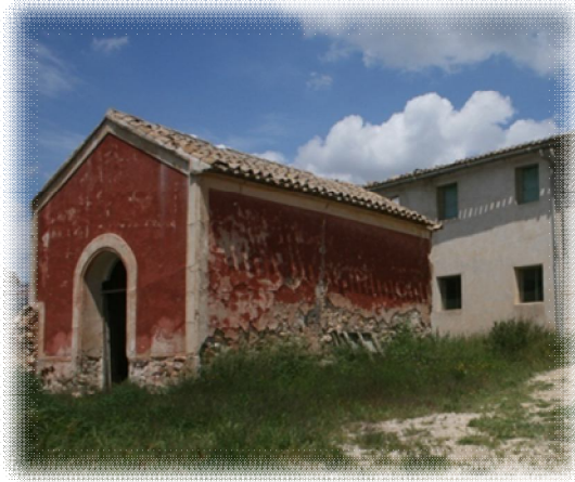
Serrano's Hermitage (Ermita Serrano in relationship with Isabel Molina's Church and Casa Serrano)