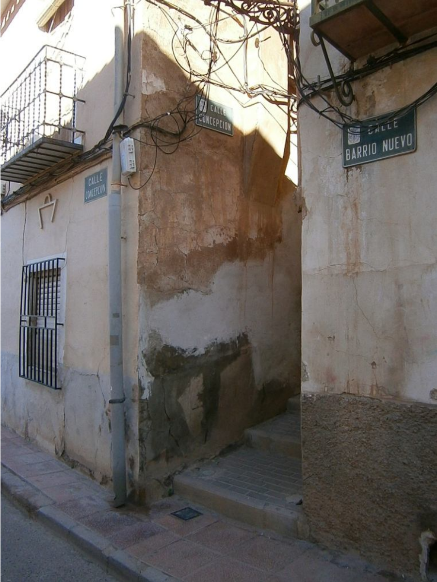
Previous place of the Hermitage Ermita de la Concepción