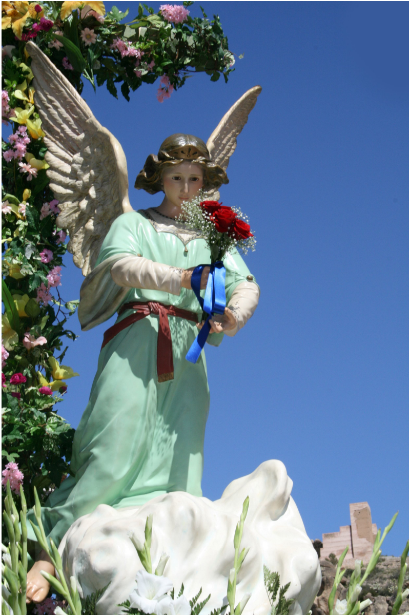
Triumphant Angel Sculptor: Carmen Carrillo, 2006