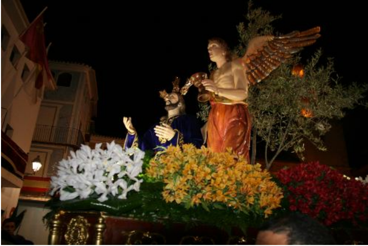
Praying in the Garden The kneeling Christ – Sculptor: Carmen Carrillo, 1988 and 2006 Angel – Sculptor: Talleres de Artes Cristiano de Olot (Gerona)