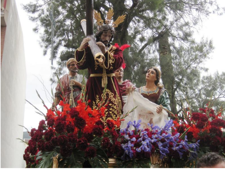
The passage of Jesus and Veronica Sculptors of the four images: Los Talleres de Arte Cristiano de Olot (Gerona) Hernandez Navarro, 1987