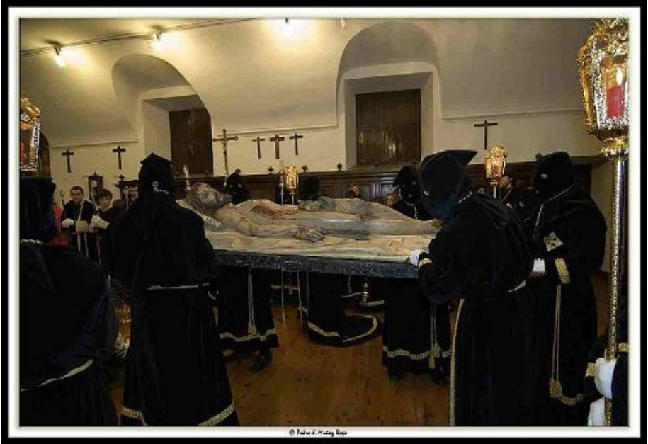
Waiting for the Resurrection, by Tere Castañeda Rivera (CC BY-SA 3.0)

Holy Saturday is a day of mourning. It is notable for the absence of official cults. The day is devoted to visiting the monuments and preparing the Easter Vigil.