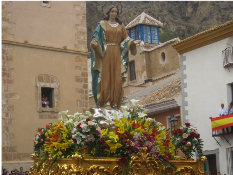
Glorious Virgin Sculptor: Carmen Carrillo, 1990