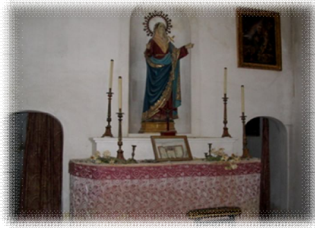
The disappeared altar of the chapel of Casa Castillo's House (Casa Castillo in relationship with Juan de Molina Castillo's church)