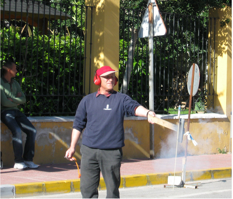
A man announces Saint Roque's celebration throwing rockets.

The altarpiece is found on the left side of the parish church of Saint John the Evangelist and was blessed and opened on 16 August 1946 at 10 in the morning after a solemn religious function in honor of our Patron Saint Roque, donated by the City council. The date of the celebration in August is fixed since Saint Roque died on the 16th of the month. The celebration is totally different and on this occasion they have the lock down of bulls, declared Regional Tourist Interest on 8 March 1990, as main attraction and the taurine fair in which figures of the bullfighter's ladder participate with ice pickers. The procession is done along the streets of the town on the 16th.