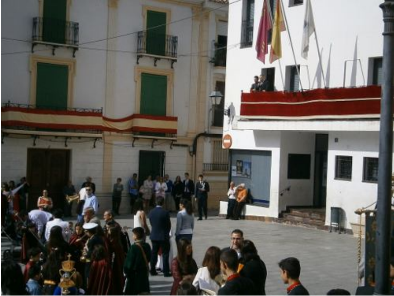
The traditional Bid of Images