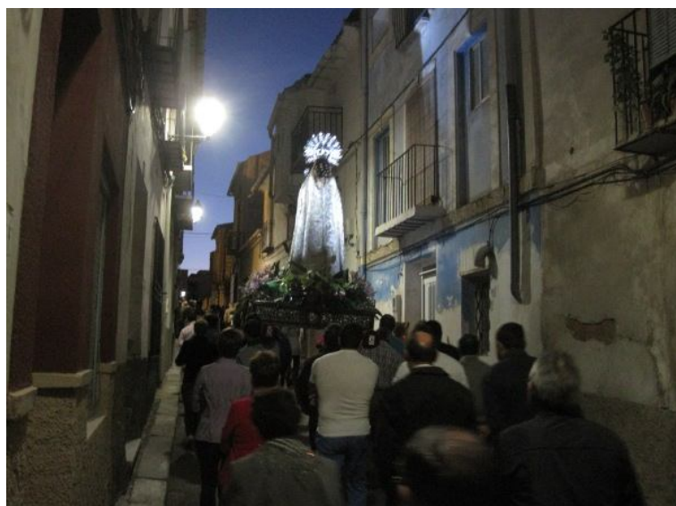
The Brotherhood of the Virgin of Rosary