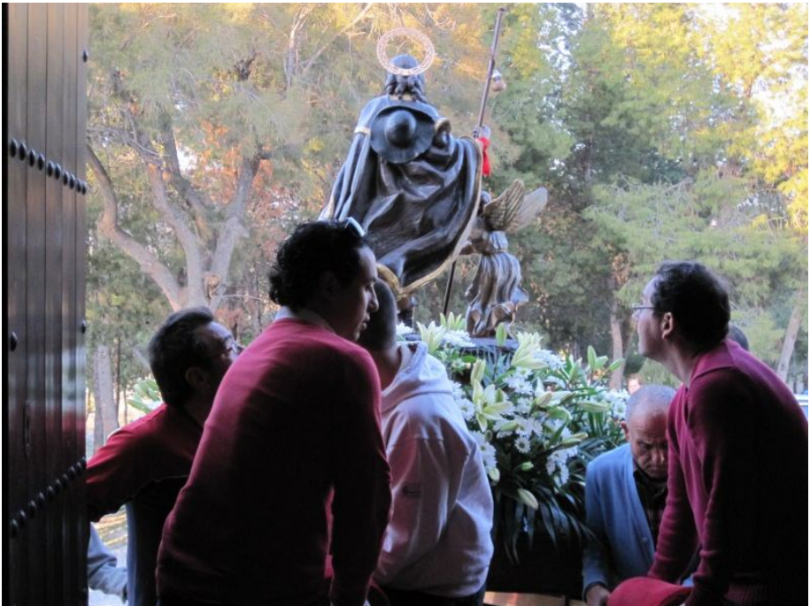
Saint Roque entering into the hermitage

We must mention the baroque Hermitage of the XVIII century, a building of three auditoriums of lower height on the sides, covered with a barrel vault, separated by pillars with arches of half a point that form chapels. Its transept is covered with a semispherical dome. The altarpiece is neoclassic, of polychrome stucco that imitates the qualities and tones of jasper. The dressing room has a square base covered with a groin vault over lunettes with high quality mural decoration in which the attributes and emblems of Saint Roque are shown. The sides are covered with decorative paintings and in the corners there are columns painted of Corinthian order imitating the quality and texture of marble with reddish and brown tones.