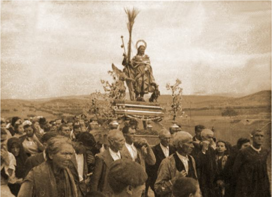
Pilgrimage of Saint Roque near the Hermitage