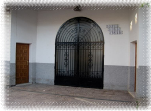
Church of the Holy Family