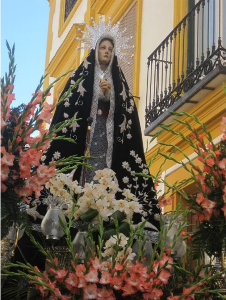
Our Lady of Sorrows (Virgen de los Dolores)