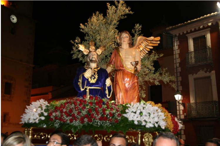
Praying in the Garden The kneeling Christ – Sculptor: Carmen Carrillo, 1988 and 2006 Angel – Sculptor: Talleres de Artes Cristiano de Olot (Gerona)