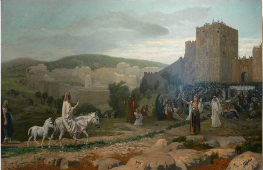
Jesus' entry into Jerusalem, by Jean Léon Gérôme (1897)