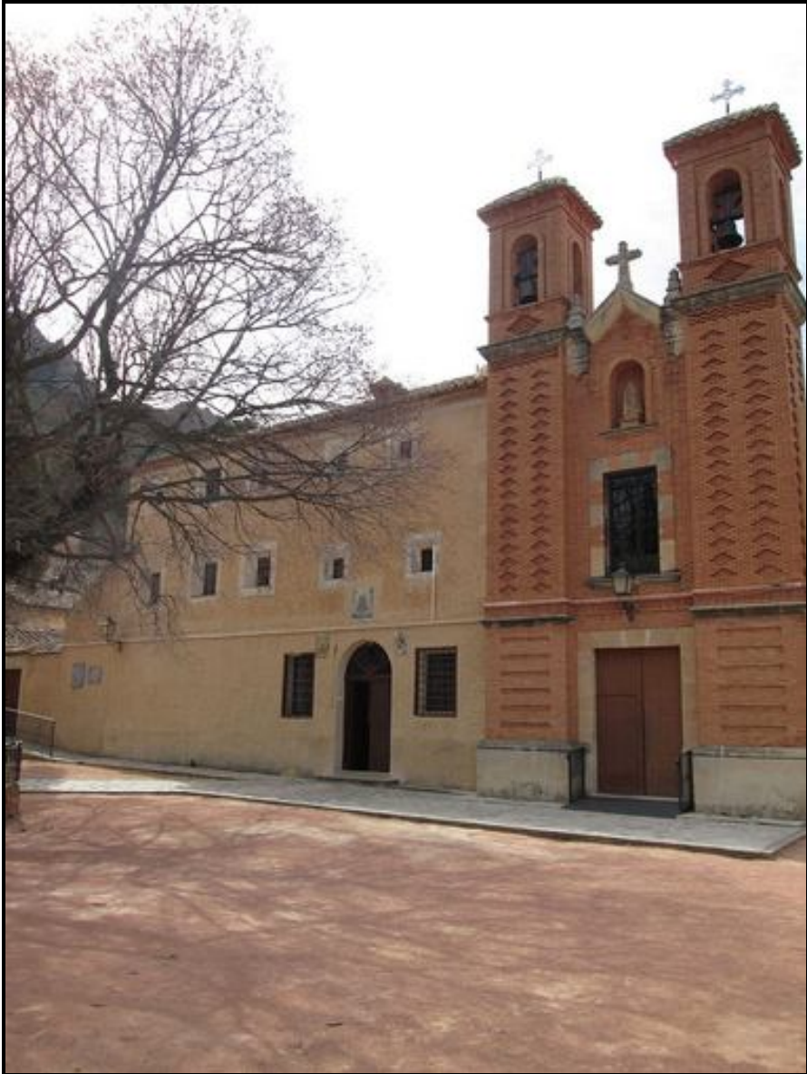
Monasterio de Santa Ana del Monte