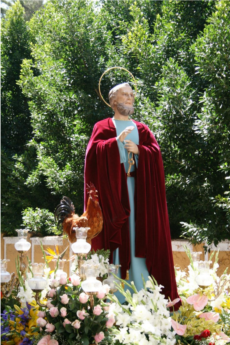
San Pedro Sculptor: Antonio García Mengual, 2000