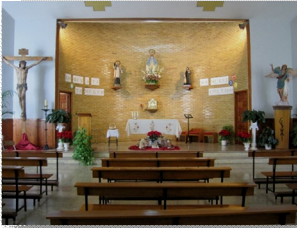
The church of “Nuestra Señora la Virgen del Pilar”