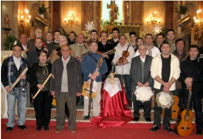
The quadrille of the Holy Souls in the church

Like every January 6 the Brotherhood of the Holy Souls of Blanca celebrated one of the most deeply rooted traditions in our town - Despedida de las Ánimas (Farewell to the spirits), which brings hundreds of faithful worshippers to the parish church of San Juan Evangelista to listen to the joyful songs which are to help invoke the Souls of Purgatory.