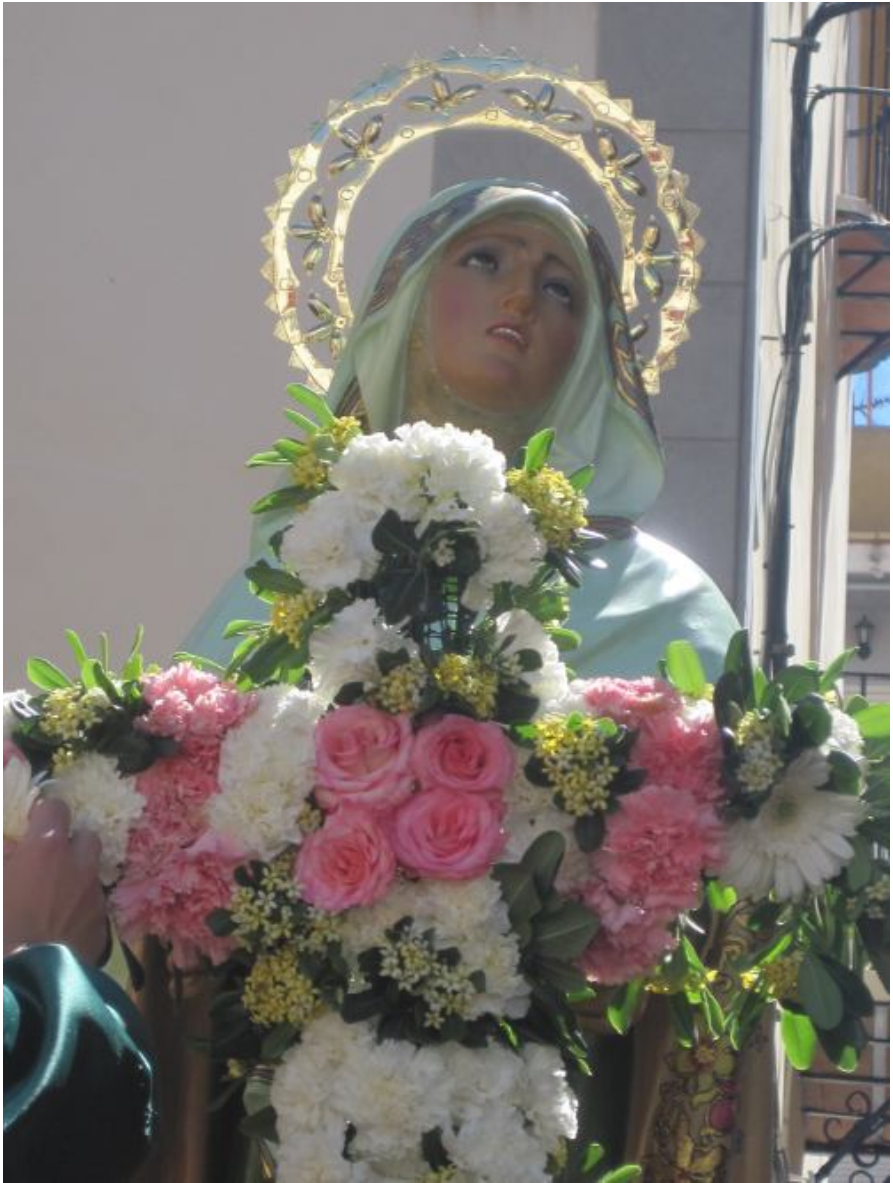
La Veronica Sculptor: Talleres de Arte cristiano de Olot (Gerona), 1994