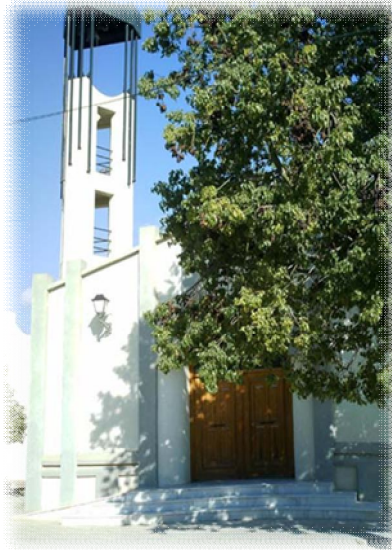
The church of “Nuestra Señora la Virgen del Pilar”