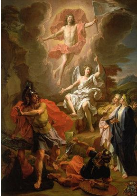
Resurrection of Christ, by Noel Coypel

Easter Sunday, which immediately follows Holy Week and begins with the Easter Vigil, is the great feast day and apogee of the Christian liturgical year: on this day the Resurrection of Jesus Christ is celebrated 13 .