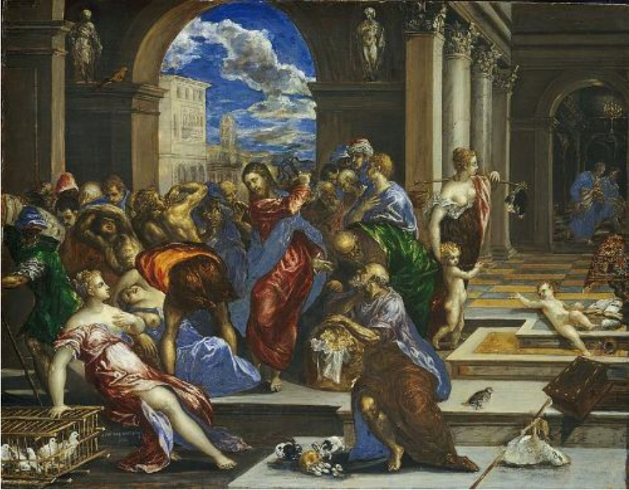
Christ driving the Money Changers from the Temple, by El Greco (1570)

Anointing of Jesus in the home of Lazarus. Jesus expels the money changers from the Temple, accusing them of turning it into a den of thieves through their commercial activities.