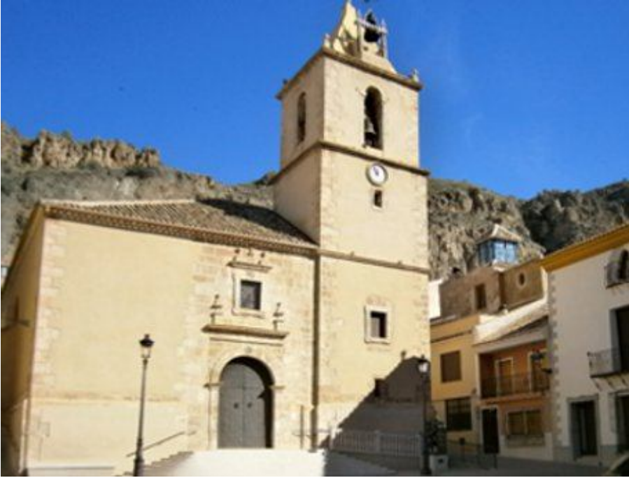
The church “San Juan Evangelista” of Blanca