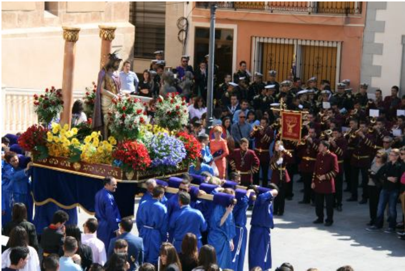
Ecco Hommo Sculptor: Talleres de Arte Cristiano de Olot (Gerona),

After the Holy Week of 1990 it was decided that they would order the image of Ecco Hommo for release in the morning of Good Friday of 1991.