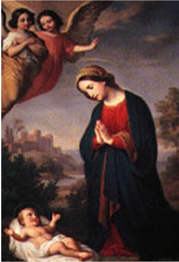
Image of the Lady of the Blessed Sacrament (from another Spanish city)