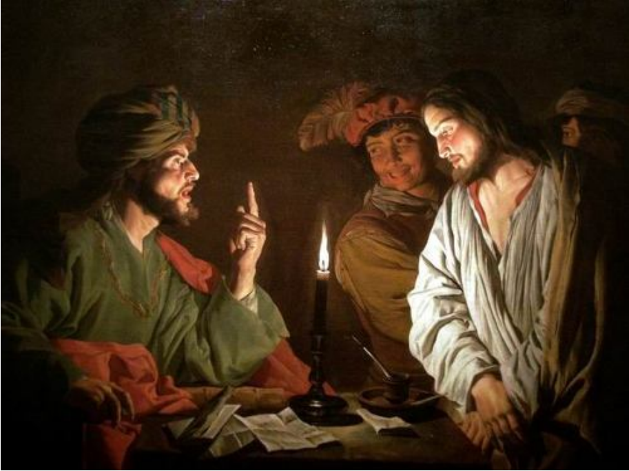
Christ before Caiaphas, by Matthias Stom (1640)

Prison of Christ. The interrogations by Caiaphas and Pilato. The flogging. The crown of thorns. Via Crucis. Crucifixion and entombment of Jesus.