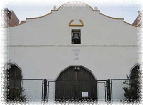
St. Peter the Apostle's Church in Blanca