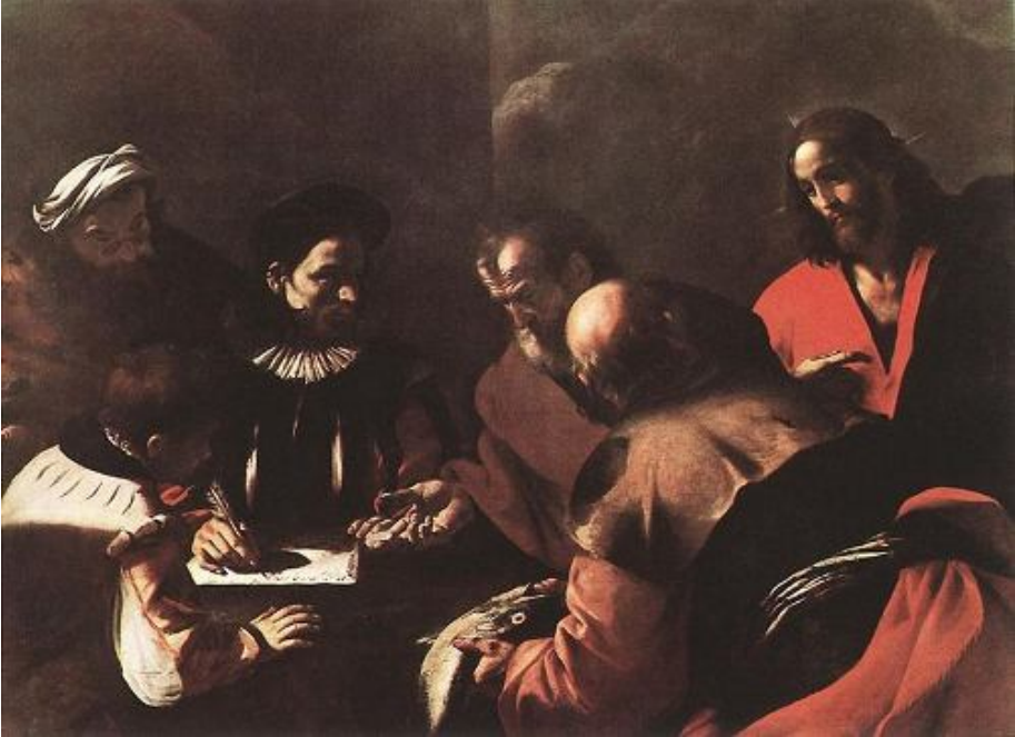
Judas receiving thirty pieces of silver, by Mattia Preti, c. 1640

Judas Iscariot, one of the twelve apostles, secretly strikes a bargain with the Jewish elder, agreeing to betray Jesus to them for 30 silver coins.