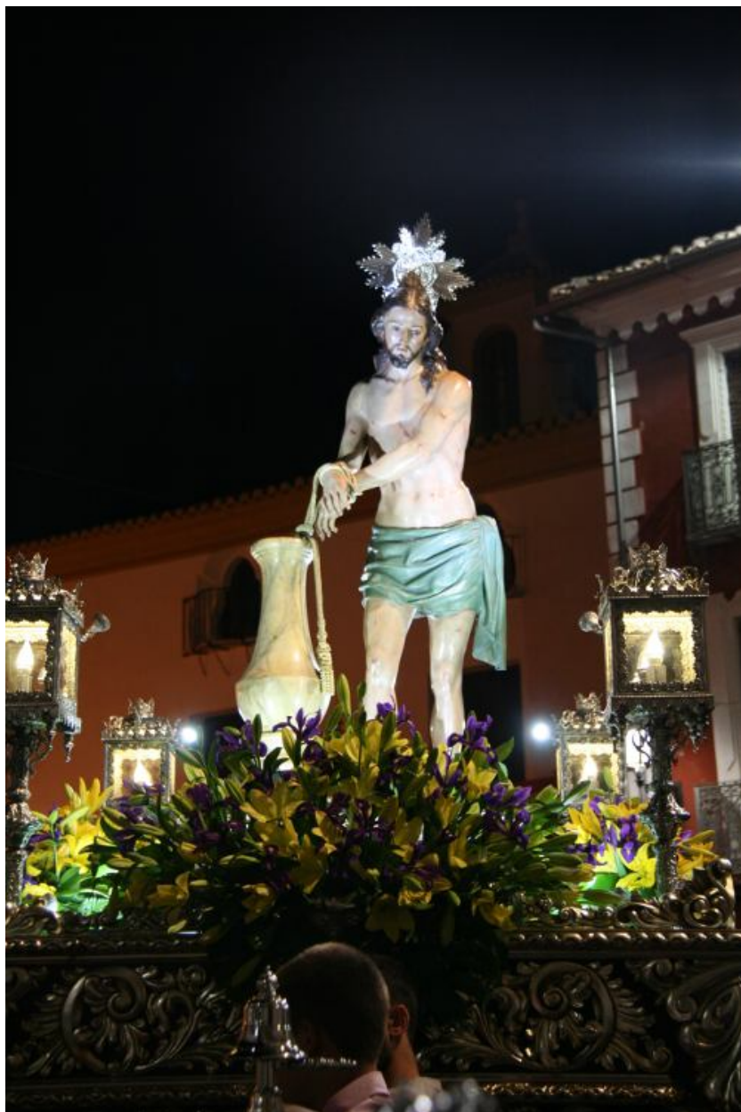
Christ tied to the column Sculptor: Francisco Sanchez Tapia, 1898