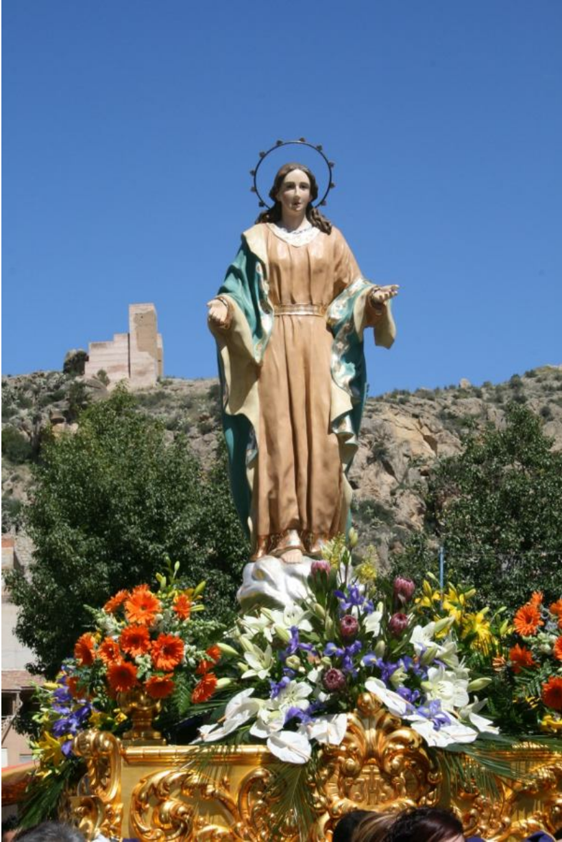
Glorious Virgin Sculptor: Carmen Carrillo, 1990