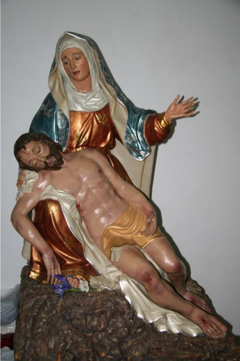
Our Lady of Sorrows of Angustias (Archive of Angel Rios) Sculptor: Tomas Pares, 1951