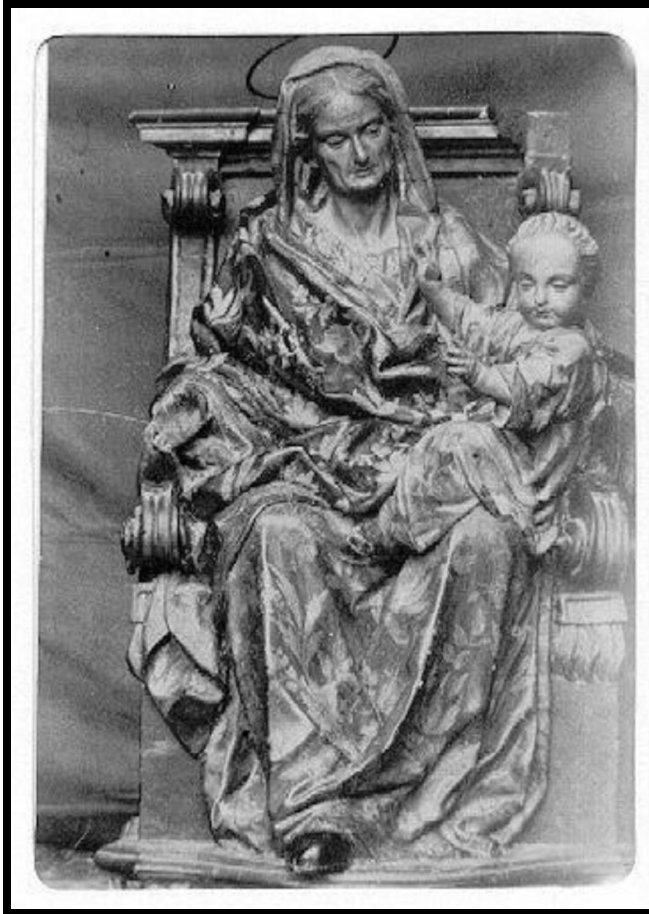
The lost image of Santa Ana