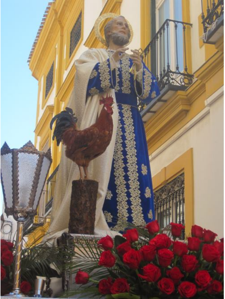
San Pedro Sculptor: Antonio García Mengual 2000