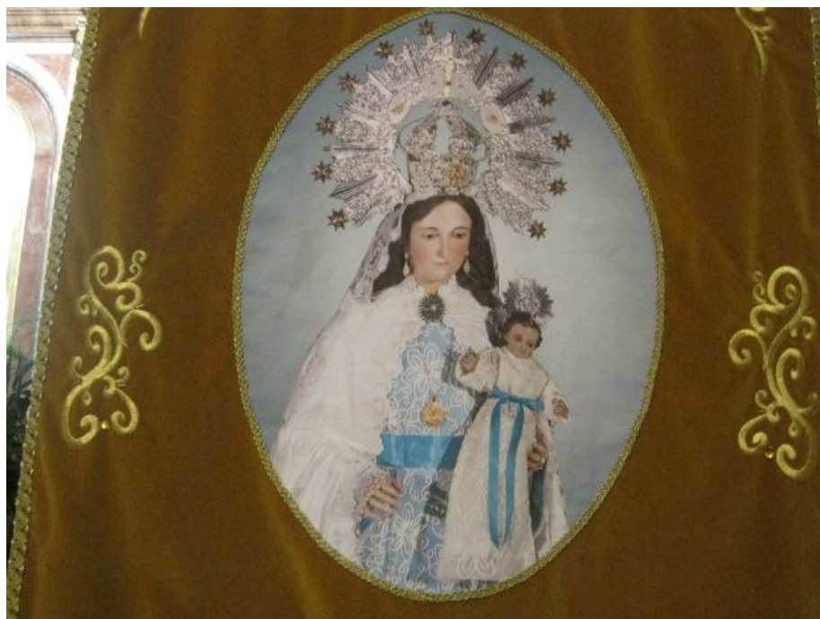
The Standard of the Brotherhood of the Virgin of Rosary