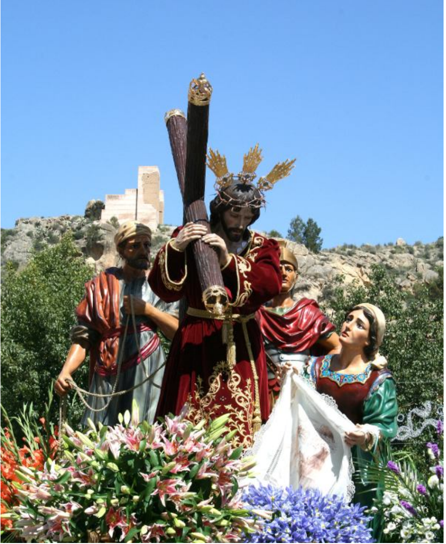
The passage of Jesus and Veronica Sculptors of the four images: Los Talleres de Arte Cristiano de Olot (Gerona) Hernandez Navarro, 1987