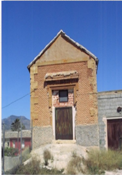
The remains of the hermitage of Bayna

The remains of the hermitage of Bayna are in the now called Barrio del Café and it is a building with a rectangular floor plan, gable roof, without decorative ornaments, but that has the peculiarity of the small bell that would let the faithful know about religious services situated on the side opposite the door above where the main altar is, and it has a small water laver near the entrance. As all aforementioned hermitages, it lacks a tower.