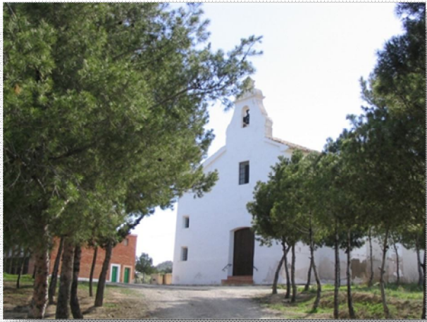
Hermitage “San Roque”