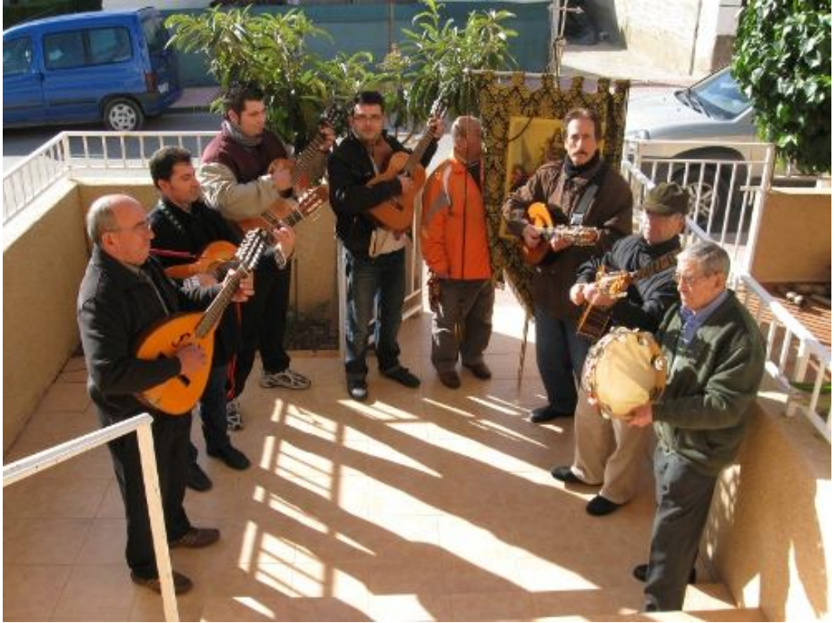
The quadrilles of the Souls with their “songs animeras”

In Blanca a quadrille led by a banner with the picture of the Virgen del Carmen, lawyer of the Purgatory, covers the streets of the town during the dates close to Christmas, singing and playing the songs animeras. The collected alms are used to help the seminar for masses for the dead and poor.