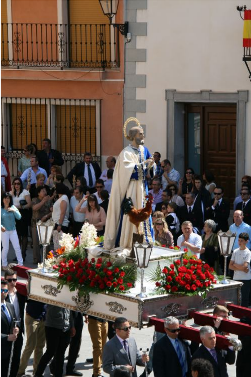
San Pedro Sculptor: Antonio García Mengual, 2000