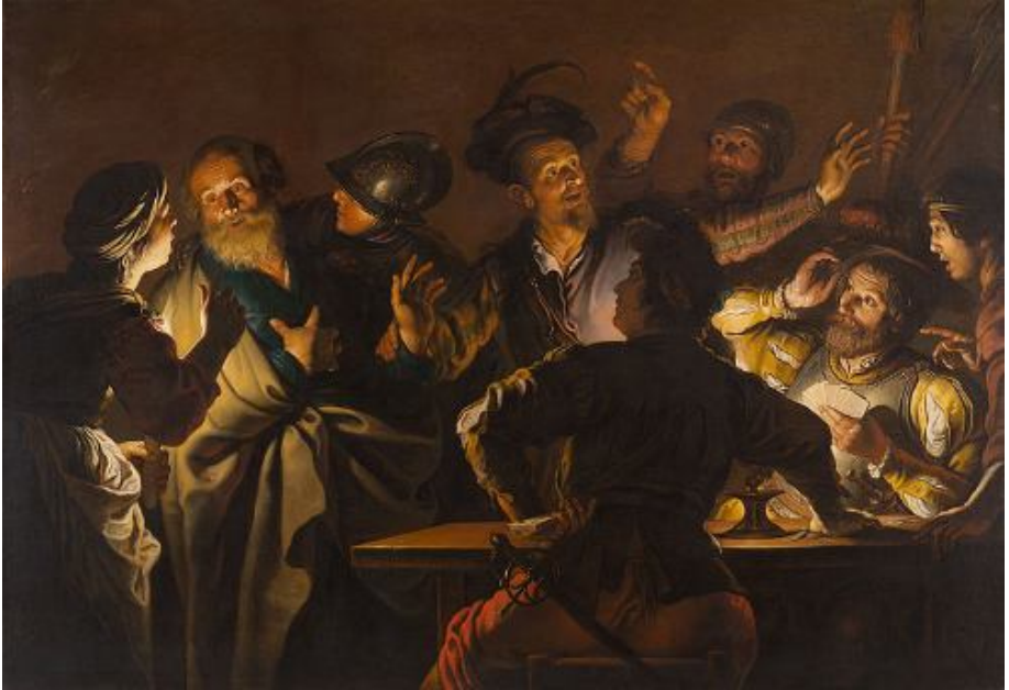
The Denial of Saint Peter by Gerard Seghers

Jesus anticipates to his disciples the betrayal of Judas and the denial of Peter.