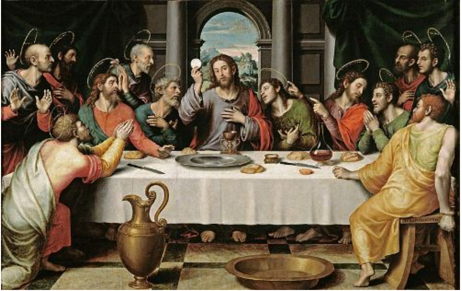
The Last Supper, painting of the 16th century by Juan de Juanes

Jesus washes his disciples' feet. The Last Supper. Eucharist. Praying in the Garden, betrayal and arrest of Jesus.