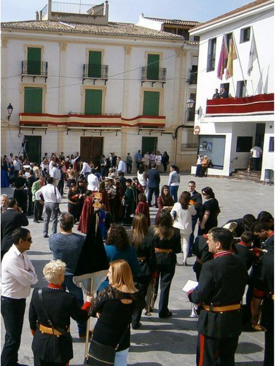
The traditional Bid of Images