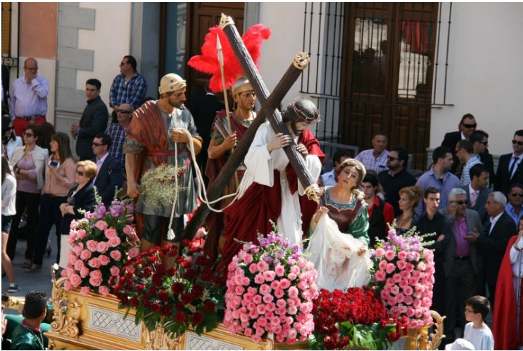
The passage of Jesus and Veronica Sculptors of the four images: Los Talleres de Arte Cristiano de Olot (Gerona) Hernandez Navarro, 1987