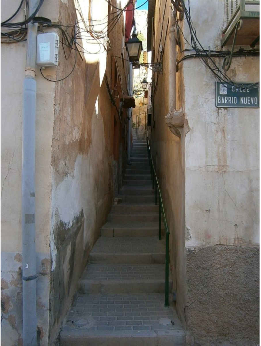
Previous street of the Hermitage Ermita de la Concepción