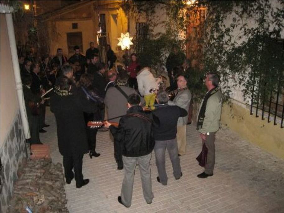
The quadrilles of the Souls with their “songs animeras”

The “Cuadrillas de Animas” (The quadrilles of the Souls) suggested to help the souls to get out of the Purgatory, and pray for them using the “songs animeras” - songs of four eight-syllable verses with a dissonant or consonant rhyme in the second and the fourth, with the first and third remaining free.