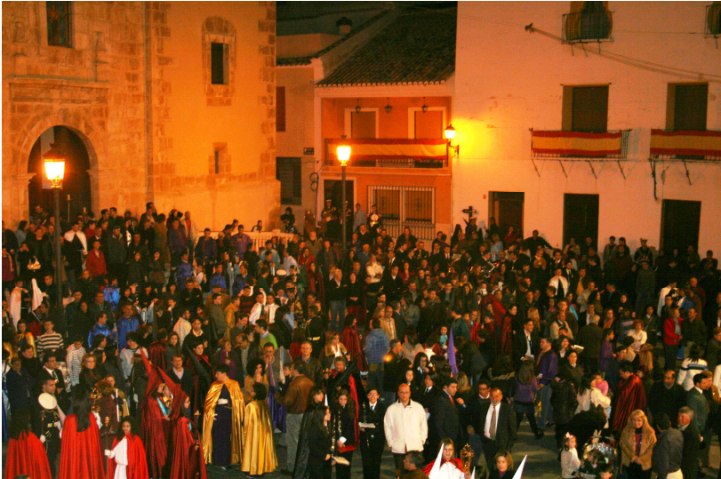
The traditional Bid of Images